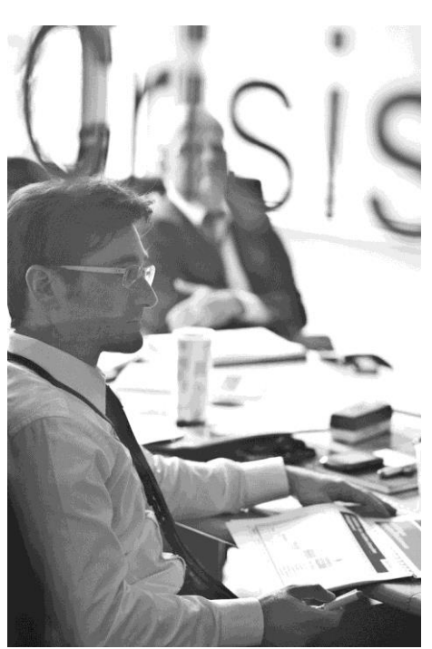
To implement a crisis cell, even reduced to an on-duty assistance around a dedicated phone line, is an essential element of security at all levels.