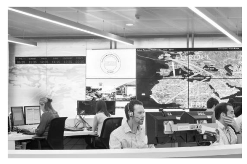
The control and the audit of health and security measures are all the more important as the impact of the incidents is increased by the distance from the traveller's home country.

It is possible that more dangers related to the topics of this control list may occur in your organisation. If so, note the necessary actions (cf. page 7).