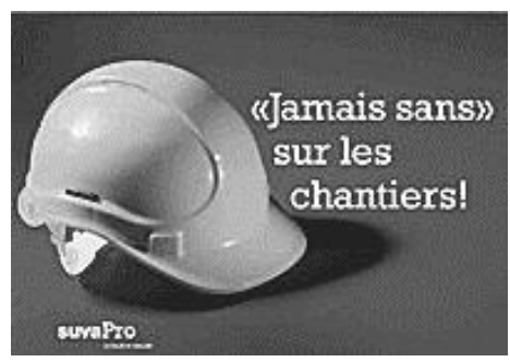
The Swiss and local safety rules are to be followed. If these differ abroad, the most protective one for the collaborator must be followed.