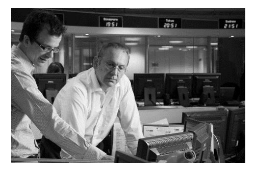
Information and training of collaborators sent abroad is highly important for their safety and the success of the mission.