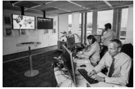
Medical and security assistance